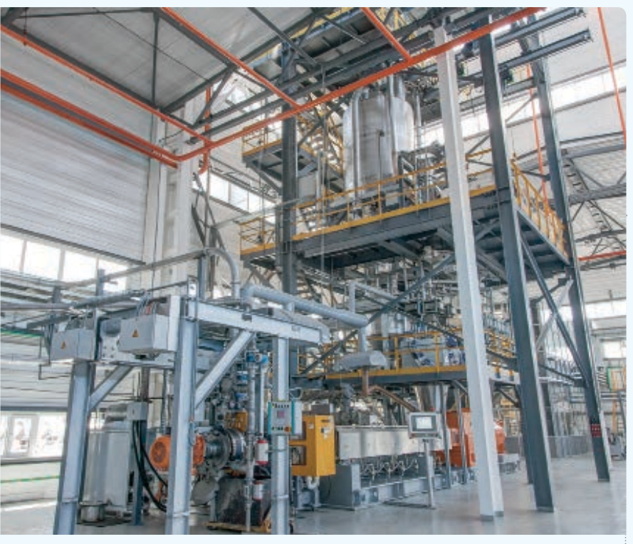
Once a system is installed, but before it is started up, conduct a preliminary evaluation of the equipment. This will include the technical documentation (SOP, FAT) as well as operating instructions. Time should be allotted for operator-related modifications to the system.

Make a note of the gearboxes that arrive from the factory filled with oil and establish which are sealed and will not require oil changes. (Synthetic oils are now being used and are good for the lifetime of many smaller gearboxes.)